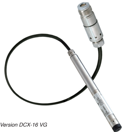
Version DCX-16 VG